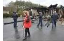
Fairway Drive Fire