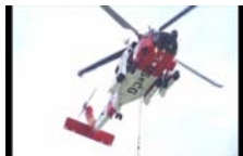
Coast Guard replaces Jetty Tower Jan 6, 2012