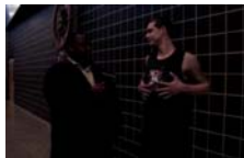
Athlete of the Week Jan 5, 2012