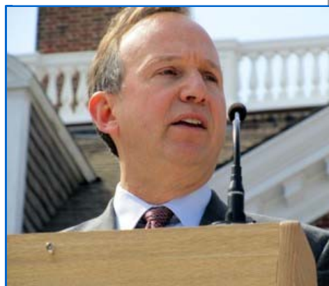
Governor Jack Markell lends his support for a civil union bill in Delaware. Two years ago he signed legislation to make illegal to fire someone because of their sexual orientation.

"It was just two years ago, until we signed the law to change it, it was legal in Delaware to be fired because of your sexual orientation," Markell told the crowd. "Anti-gay and anti-lesbian discrimination was legal because the law had